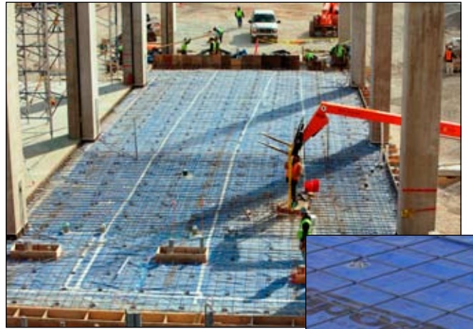
Vapor Barrier - Commercial